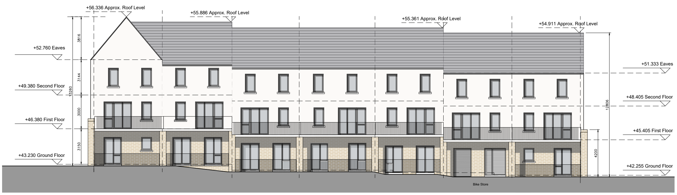
DUPLEX BLOCK A REAR ELEVATION