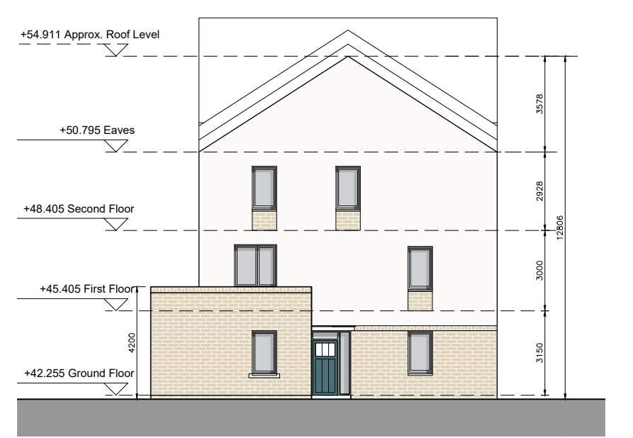
DUPLEX BLOCK A SIDE ELEVATION (EAST)