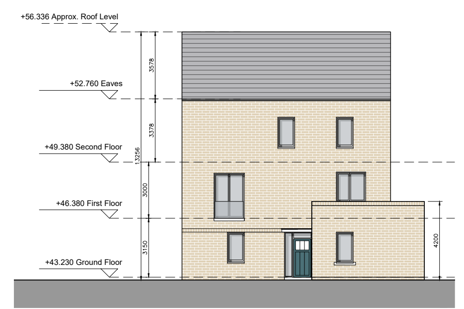
DUPLEX BLOCK A SIDE ELEVATION (WEST)