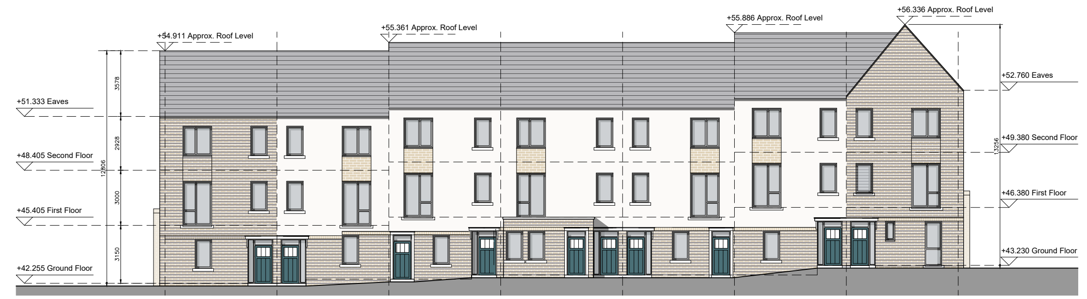
DUPLEX BLOCK A FRONT ELEVATION